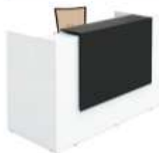
SORRENTO RECEPTION DESK

Counter Body -finished in matt beech melamine front panel and side panels. Desk Top -matt white melamine desktop . Hob Top -gloss melamine featured hob in white.