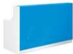
ROMA RECEPTION DESK