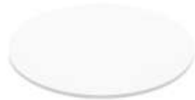
MEETING TABLE TOP