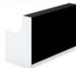
ROMA RECEPTION DESK