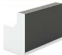
ROMA RECEPTION DESK