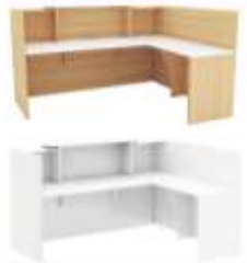
SORRENTO RECEPTION DESK RETURN

Counter Body -finished in gloss white melamine front panel and side panels. Desk Top -matt white melamine desktop. Hob Top -matt melamine featured hob in charcoal .