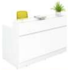
CLASSIC RECEPTION DESK