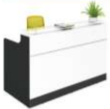
CLASSIC RECEPTION DESK

Counter Body -finished in high gloss white melamine front panel, white side panels and kick board. Aluminium front panel strip Desk Top -matt white melamine desktop. Hob Top -white glass hob supported on chrome pillars.