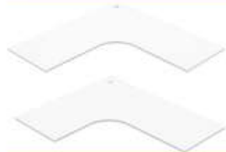
ONE PIECE WORK STATION DESK TOP