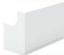
ROMA RECEPTION DESK