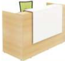
SORRENTO RECEPTION DESK

Counter Body -finished in high gloss white melamine front panel, black side panels and kick board. Aluminium front panel strip Desk Top -matt white melamine desktop. Hob Top -white glass hob supported on chrome pillars.